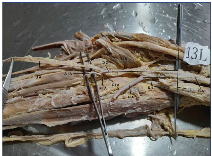
[Table/Fig-5]: D1- Distance of normal division of Brachial Artery (BA) into Radial (RA) and Ulnar Artery (UA) from Inter Epicondylar Line (IEL) of humerus (IEL). D2- Distance of origin of Common Interosseous Artery (CIA) from Inter Epicondylar Line (IEL) of humerus.