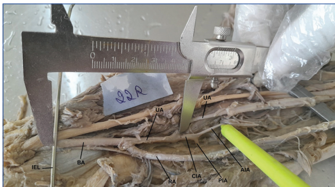
[Table/Fig-2]: Measurement of distance of origin of Common Interosseous Artery (CIA) from Inter Epicondylar Line (IEL) of humerus using vernier caliper (D2).