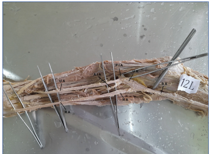
[Table/Fig-3]: Terminal branches of brachial artery at elbow. Brachial Artery (BA), Radial Artery (RA), Ulnar Artery (UA), Anterior Interosseous Artery (AIA), Posterior Interosseous Artery (PIA). Common Interosseous Artery (CIA) was absent. Anterior Interosseous Artery (AIA) and Posterior Interosseous Artery (PIA) were arising directly from Ulnar Artery (UA).

The mean distance (D1) of normal division of BA into the RA and UA at elbow was 2.8 \pm 0.6 cm Below the imaginary line joining the medial and lateral epicondyles of the humerus (IEL) of the humerus. The median value was 3 cm. The mode value was 2 cm. The range value was 2 cm with minimum value of 2 cm and maximum value of 4 cm. The mean distance (D2) of normal origin of CIA was 6.8 \pm 1 cm below the imaginary line joining the medial and lateral epicondyles of the humerus (IEL). The median value was 6.8 cm. The mode value was 6 cm. The range value was 3.2 cm with minimum value of 5 cm and maximum value of 8.2 cm [Table/Fig-4,5].